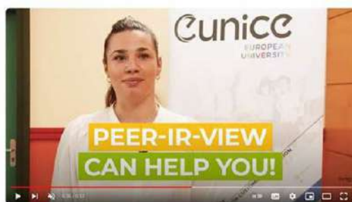
Peer-IR-View Project (Eunice European University)

The Peer-IR-View project, funded by the Erasmus+ Programme of the European Union and which started in 2020, came to an end in September 2023 with the release of 16 tools made by and for International Relations Offices within higher education institutions, all available on EUNICE website.