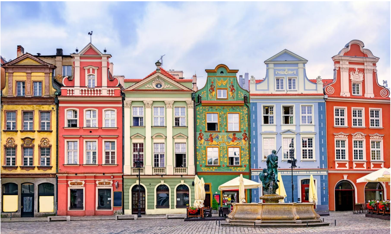
(c) Perfect palette ... Old Market Square, Poznań. Photograph: Xantana/Getty Images/iStockphoto